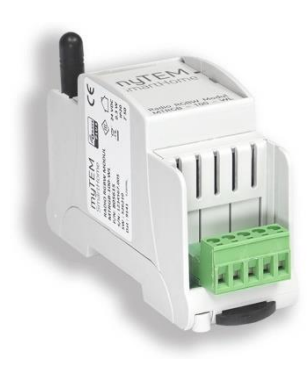
myTEM Radio RGBW module MTRGB-100-WL

The myTEM Radio RGBW MTRGB-100-WL is a module for controlling and dimming 4-coloured LED strips. In addition to the red-green-blue-white color control, a warm white setting can be realized if the LED strip supports this function.