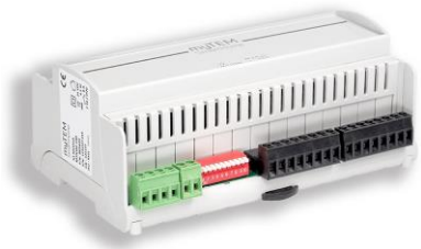
myTEM IO Modul MTIOM-100

The IO module MTIOM-100 is a universal module from myTEM for extending your smart home system with additional inputs and outputs. For this, the device is connected to your central myTEM Smart Server via the CAN bus system.