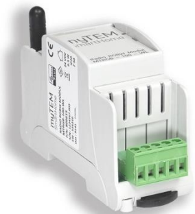
myTEM Radio RGBW module MTRGB-100-WL

The myTEM Radio RGBW MTRGB-100-WL is a module for controlling and dimming 4-coloured LED strips. In addition to the red-green-blue-white color control, a warm white setting can be realized if the LED strip supports this function.